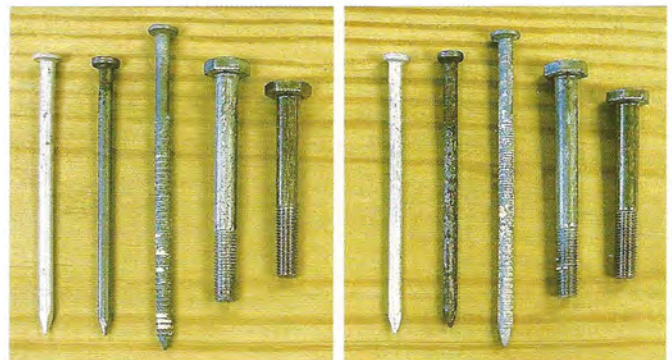
Ecolife treated wood

Ecolife provides improved fastener performance and is no more corrosive to fasteners and metal fittings than untreated wood. Ecolife can be used in direct contact with aluminum building products. Use of fasteners and contact with aluminum products is recommended in compliance with applicable building codes and fastener manufacturers recommendations.